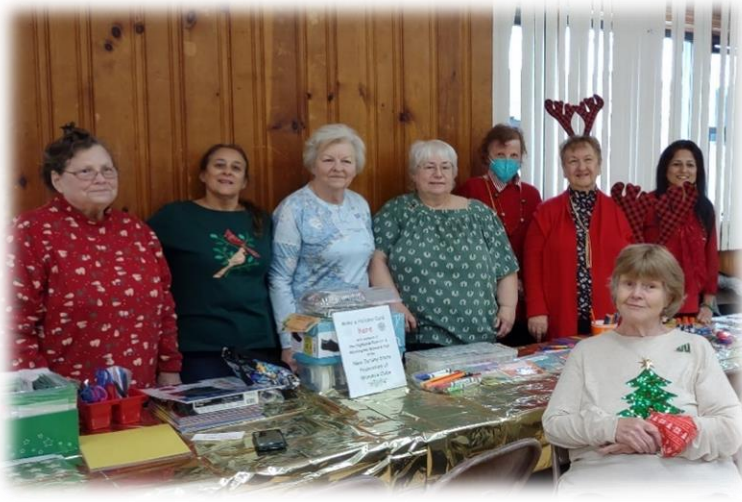
ECF's Holiday Party December 11 - 3 Club members and one prospective member helped at a crafts table where children made greeting cards