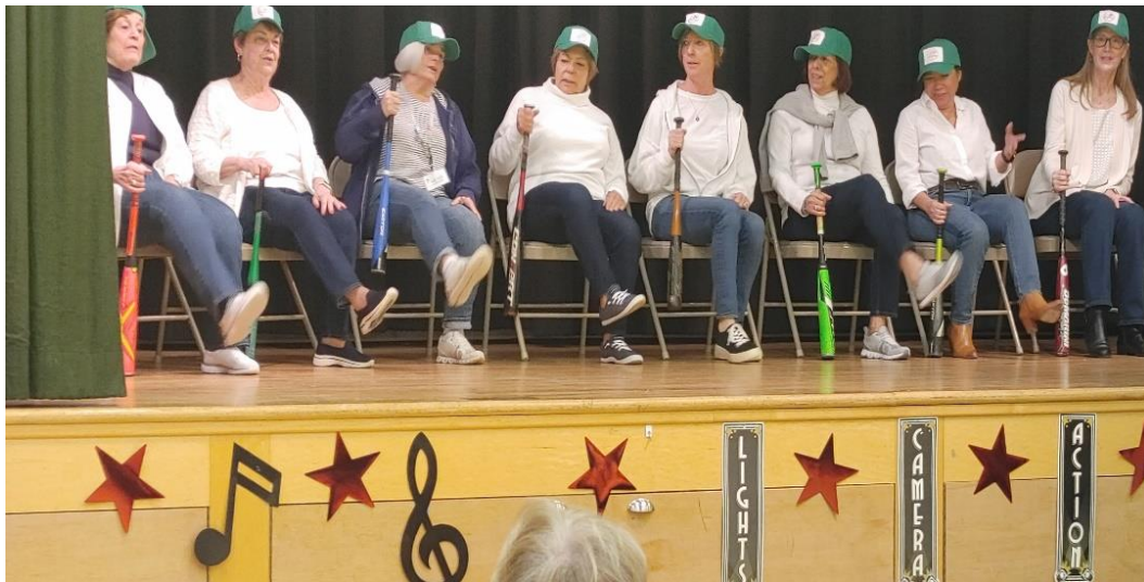
"Take Me Out to the Ballgame" Thursday Morning Club