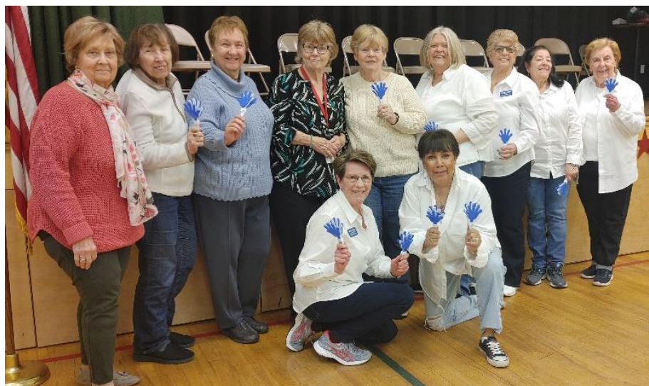
Woman Club of Parsippany Troy- Hills