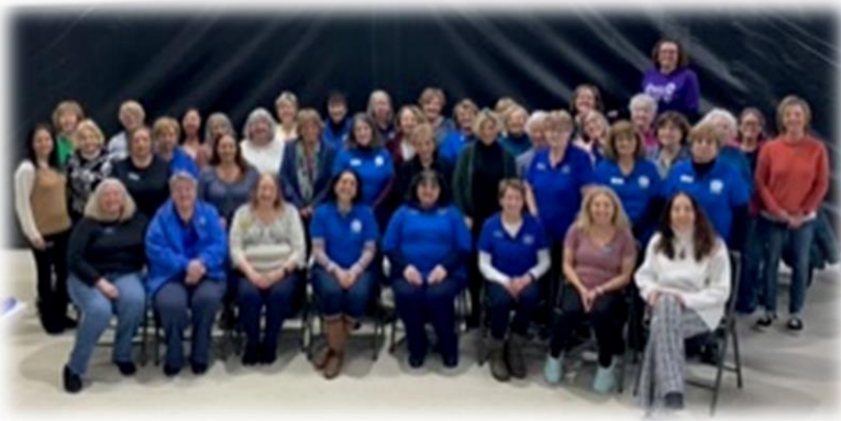
41 members from eight clubs gather to sort and pack the donations from their clubs.