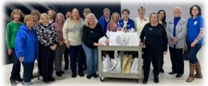
17 members of our club attended and were very generous with their donations and their time