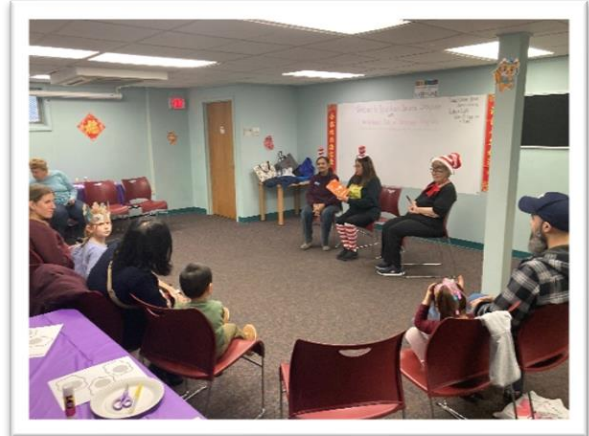
Dr. Seuss reading at the Lake Hiawatha Library (above and below)