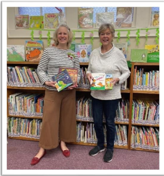
Books donated to Mt Tabor Library to celebrate Dr Seuss and Reading Across America.