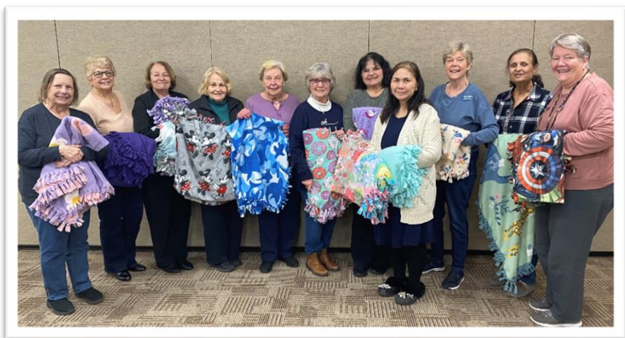
Members made no-sew blankets for Project Linus on March 18th