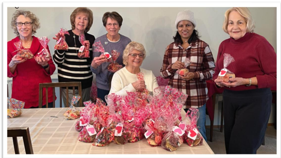
Members baked Valentine's cookies for the Firemen's Home in Boonton and the Country Home in Morris Plains.