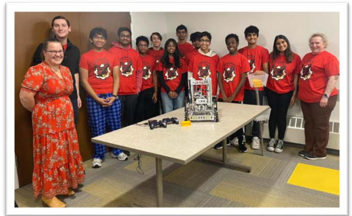
Fifteen students and two teachers from the Parsippány Robotics Team came to our January meeting to explain how they created and built this robotic machine and demonstrated it for us.