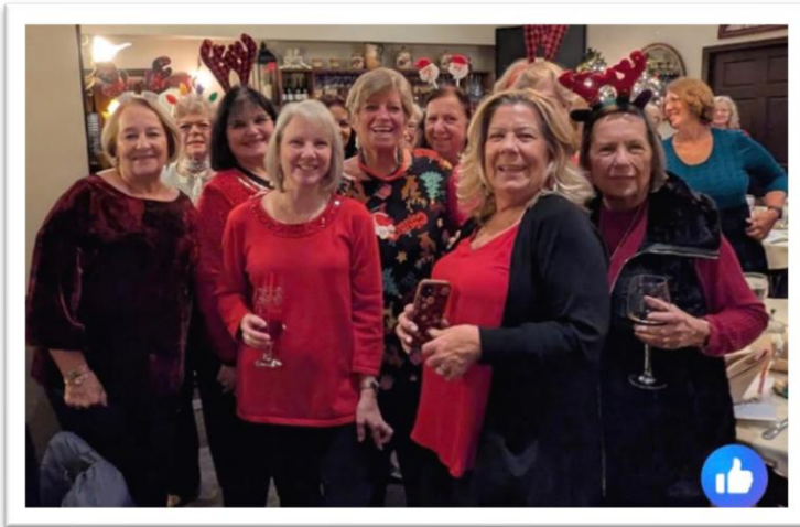
Holiday party at Caffe Navona's, Dec 12, 2025