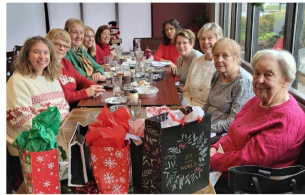
Literature Club Holiday lunch at Suppas, Dec 2nd