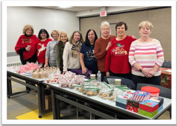
Club Cookie Swap at the Library Dec 3rd