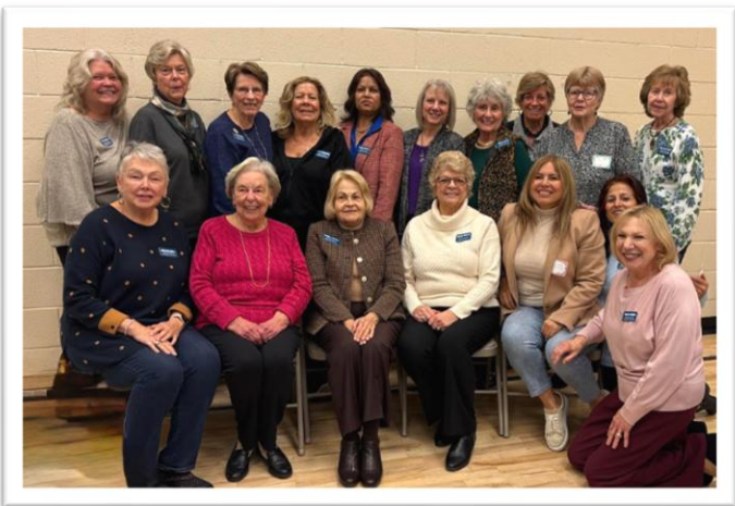
Members attended the District Highlands Council Meeting January 14 th