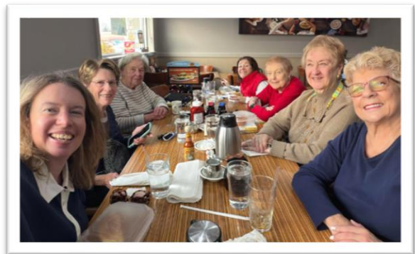
Literature Club Meeting at iHOP, January 6