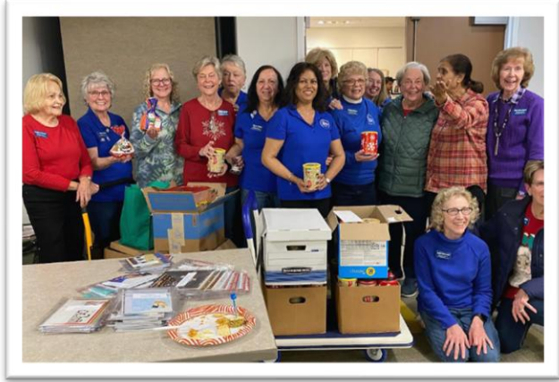
Packing Cookies for the Nursing Homes Nov 24th