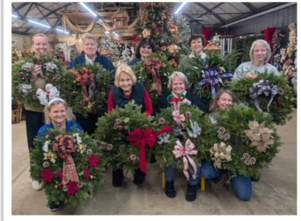
Wreath making at Cerbos, Dec 4th