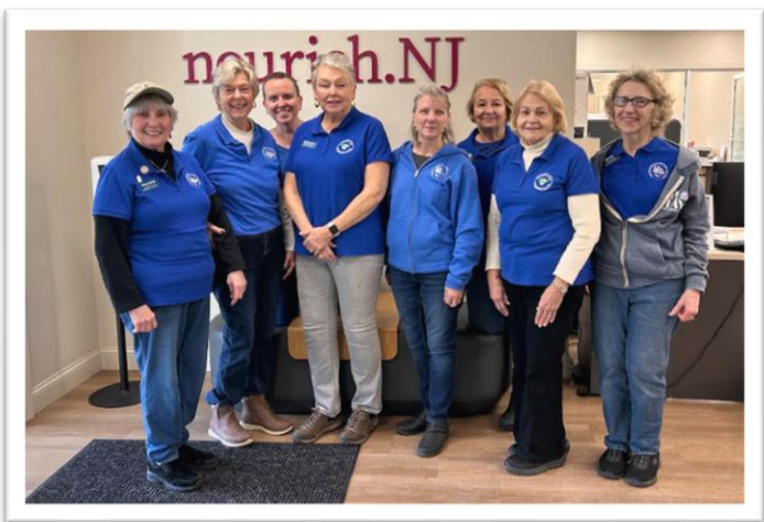
Members attended the MLK Day of Service at NourishNJ January 19 th